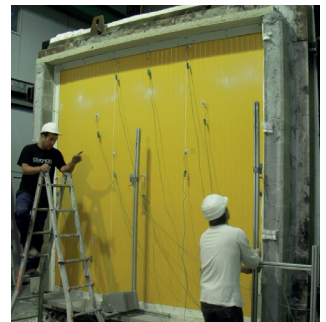
Large Scale Test EI - 30

The addition of the material to the fire mass, the amount of smoke to be released by the material at time of fire, and whether the droplets causing fire growth are formed, are checked at this test.