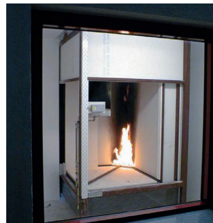
Medium Scale Test B, s_1, d_0

This test is conducted to observe the burning behavior of the core insulation material used in the panel system.