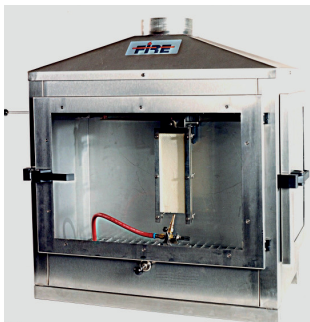
Small Scale Test 5-7 cm Flame Height

This test is conducted to observe the burning behavior of the core insulation material used in the panel system.