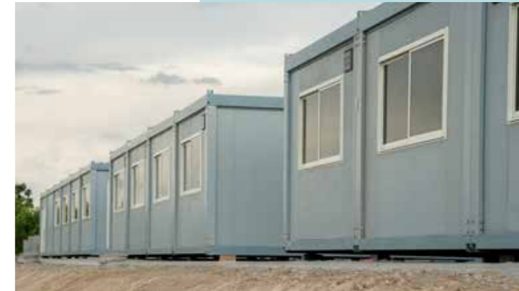
larger rapid build constructions that are low cost to run.