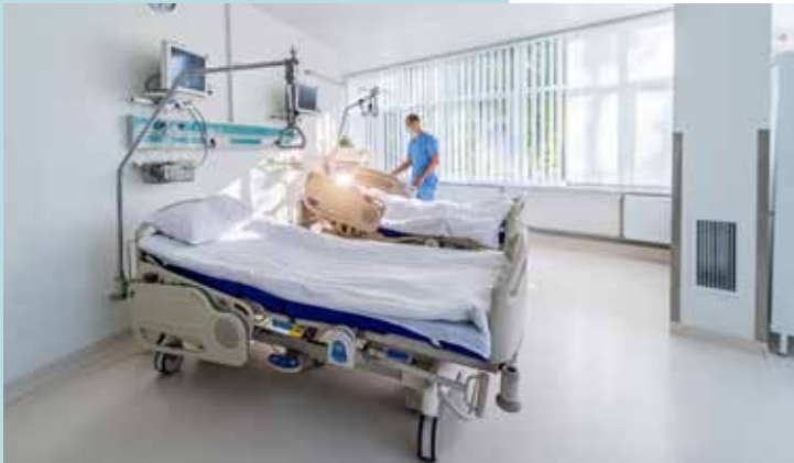
Housing 88 beds in a suitable layout for delivering highly efficient healthcare support,

As a natural result of the importance it places on sustainability and its environmental sensitivity the company achieved its ISO 14001 environmental management system certification in 2012. The Assan Panel Quality approach has also been documented beyond our borders with Gost-Russia and UkrSEPRO / Ukraine quality certificates. Assan Panel has also earned FM Global and LPCB certificates in fire, wind and impact endurance for its sandwich panels. Also the company was the first and only company to earn both the UL Greenguard and Greenguard Gold certificates with environmentally friendly products that do not compromise the indoor air mass. Assan Panel, the most preferred brand in the sandwich panel market with the objective of providing added value to Turkey, exports to 76 countries.