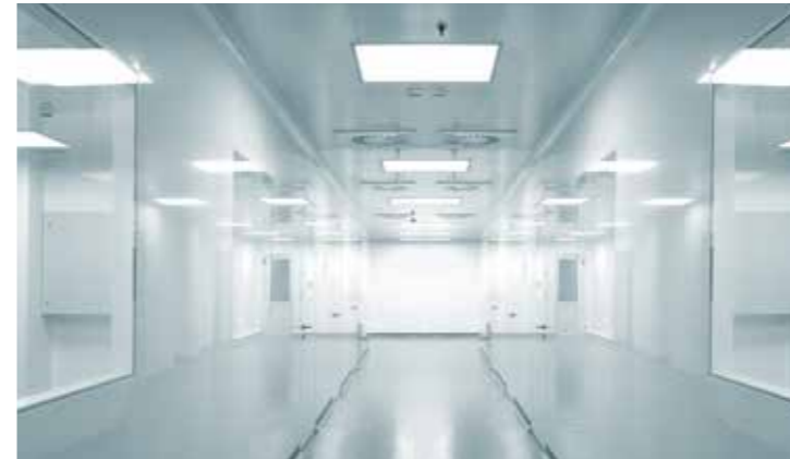
Bed configurations and the placement of adaptable,