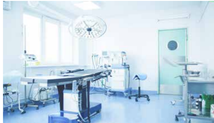
facility is designed specifically for larger health emergencies impacting communities.